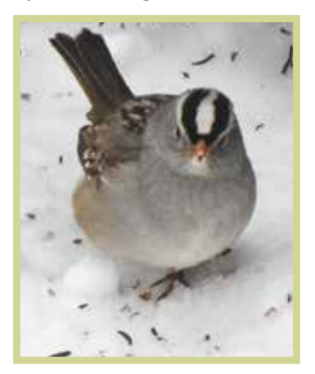
White-crowned Sparrow by Sandy Hokanson