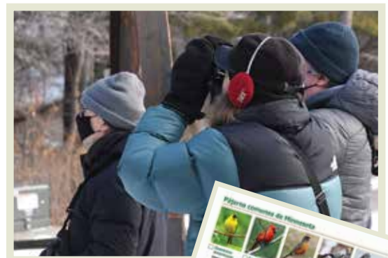
Free guided bird walks take place on the first Saturday of each month at Quarry Hill.

With your help we can bring our mission of environmental awareness, appreciation and advocacy to the community. Donate or learn how to volunteer at ZumbroValleyAudubon.org .