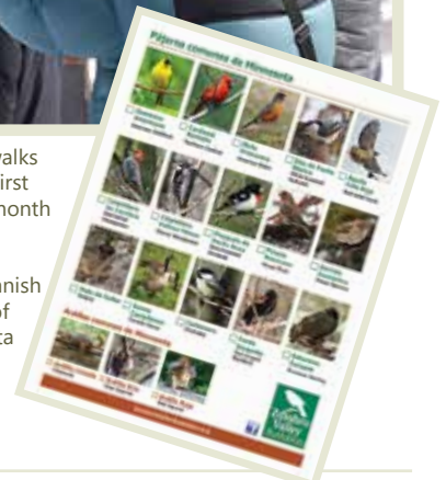
We provided a Spanish translation guide of common Minnesota birds at our first bird walk for Spanish speakers.

Follow Zumbro Valley Audubon on Facebook – like us!