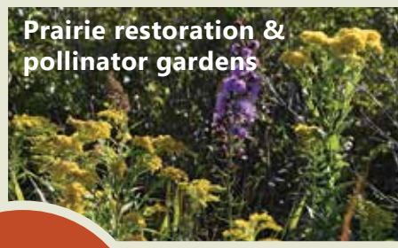
Prairie restoration & pollinator gardens