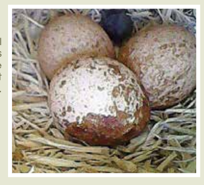
"Birds are indicators of the environment. If they are in trouble, we know we'll soon be in trouble."