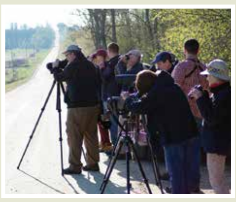
Our experts help people learn about birds, important birding areas and more during our free field trips.