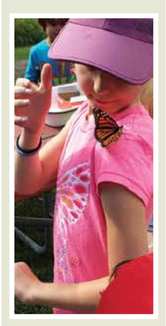
Our "All About Monarchs" event at Quarry Hill is a big hit each fall.

Volunteering with us is fun and rewarding. You can help us bring our mission of environmental awareness, appreciation, and advocacy to the community. Visit ZumbroValleyAudubon.org to learn more.