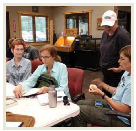
Learning about butterflies at a free class before the annual survey in July.