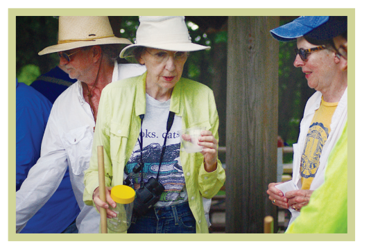
Insect identification class