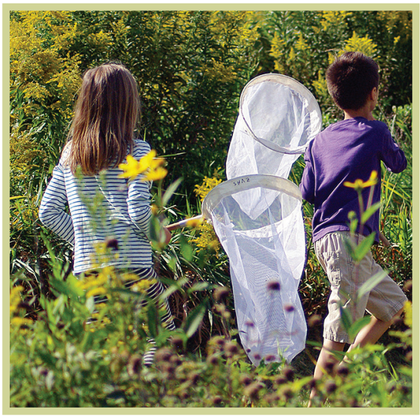
Catching and tagging monarchs at Northern Hills Prairie.

Family Friendly Activities: It is important that children get frequent experiences in nature. To do that their parents need to be supportive, and the opportunities need to be local. When we provide fun, hands-on activities, kids and adults come away with a renewed sense of wonder. We believe there is great potential in this area.