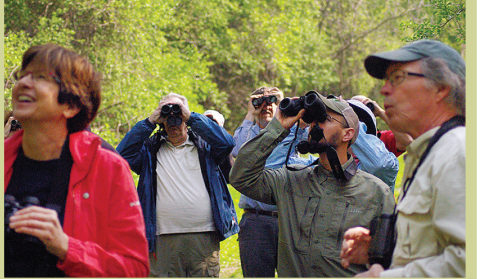
Monthly bird walks at Quarry Hill

Our Volunteers: We couldn't function without our volunteers. Last year they provided over 1,100 hours of their time and expertise. If we had to pay for this time – the cost at just $10 per hour would have been a staggering $11,000!