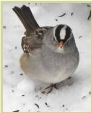
White-crowned Sparrow by Sandy Hokanson