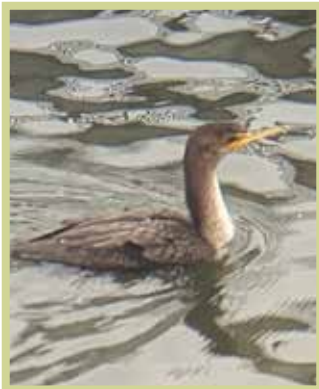
Juvenile Cormorant