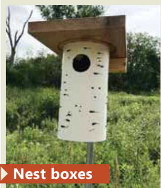
▶ Nest boxes