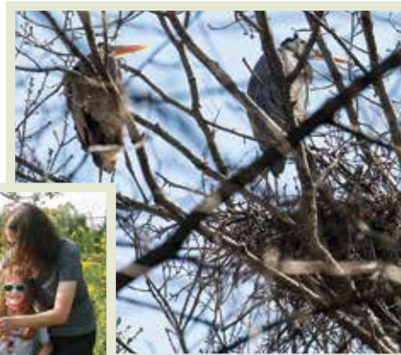
Above: Two Great Blue Herons at the Rookery. Left: Monarch tagging event.

We continue to provide educational resources via online meetings, our free eNewsletter, Facebook, fliers, posters, bookmarks, educational handouts, trail signs and our web site at ZumbroValleyAudubon.org.