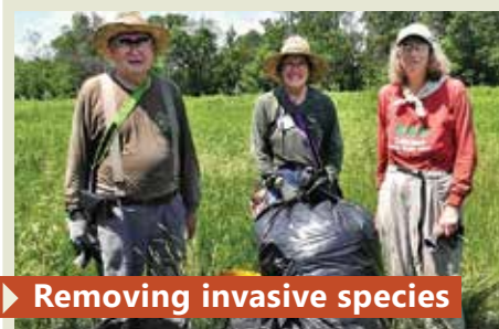
▶ Removing invasive species