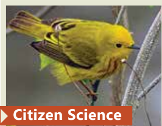
▶ Citizen Science