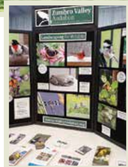
Right: free informational materials provided at the 2021 Olmsted County Fair.