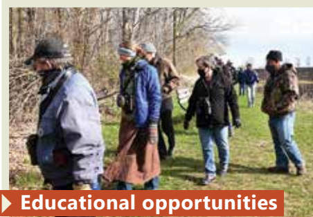
▶ Educational opportunities