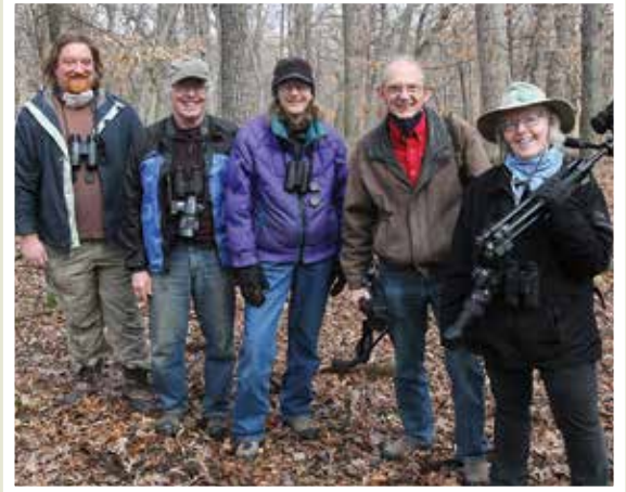
Board members after visiting the threatened Great Blue Heron Rookery in southwest Rochester.