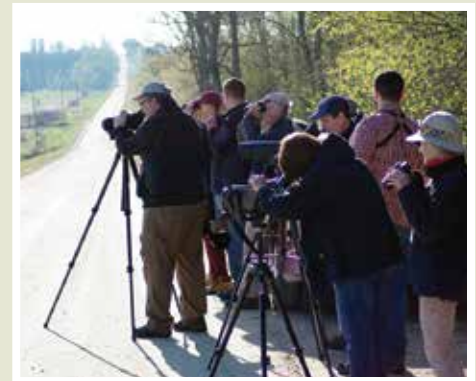
Our experts help people learn about birds, important birding areas and more during our free field trips.