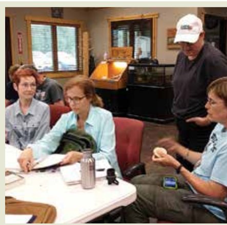
Learning about butterflies at a free class before the annual survey in July.