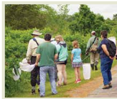
Catching and getting closeup looks at dragonflies at Chester Woods.

In 2019 your money took flight! It was used to provide free programs, grants and sponsorships for local groups and special projects, and much more.