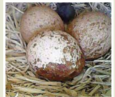
Kestrel eggs in one of our nest boxes.

"Birds are indicators of the environment. If they are in trouble, we know we'll soon be in trouble."