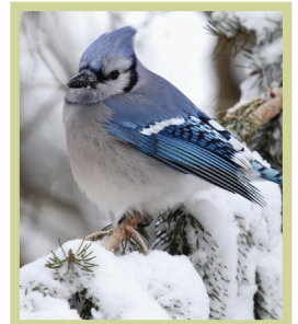
Blue Jay

Each year teams of interested birdwatchers search designated sections of the Rochester area to see what birds can be found. We'll meet at 7:15 am at the west Silver Lake parking lot (near the former fire station), then take a break from noon - 1pm at Quarry Hill Nature Center for a quick lunch and tally. More counting is done in the afternoon with a final tally held at 4:45 at Quarry Hill. You're invited to participate with one of our teams for part, or all of the day's count. Be prepared for the weather, bring your own binoculars, lunch and beverages.