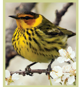
Cape May Warbler by Denise Dupras

Can you help conserve birds and nature just by having a cup of coffee? Yes, if it's the right kind of coffee! Migratory birds that spend the winter in the tropics will thank you for buying only shade-grown coffee. Find out why at this fascinating talk.