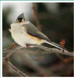
Tufted Titmouse