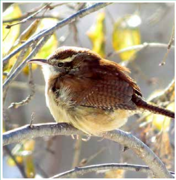
Carolina Wren