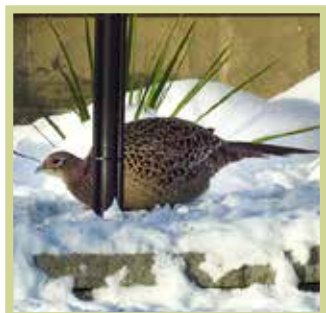
Pheasant by Patty Trncka