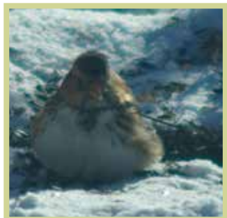
Harris Sparrow