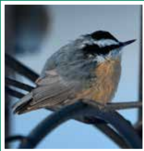
Red Breasted Nuthatch by Terry Grier