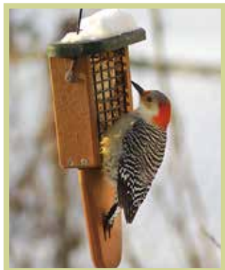
Red-bellied Woodpecker